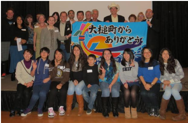
Otsuchi visitors and locals at the Welcome Dinner